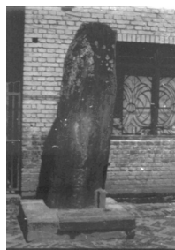
Asitaangaa-Bhairava. Iconic form of the "stone-god." Bhaktapur, Nepal (Grieve 1995 [C])