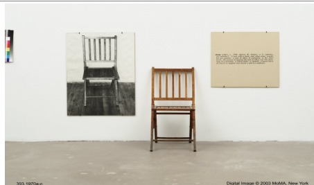
Kosuth, Joseph (1945-) (c) Copyright ARS, NY One and Three Chairs, 1965. Wooden folding chair, photographic copy of a chair, and photographic enlargement of a dictionary definition of a chair; chair 32 3/8 x 14 7/8 x 20 7/8"; photo panel, 36 x 2...

Location : The Museum of Modern Art, New York, NY, U.S.A.